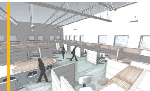
Photos are conceptual drawings for the Food Lion space (30,280 SF) in Rutherfordton, North Carolina.

Building & Site information can be found at www.rutherfordncdc.com